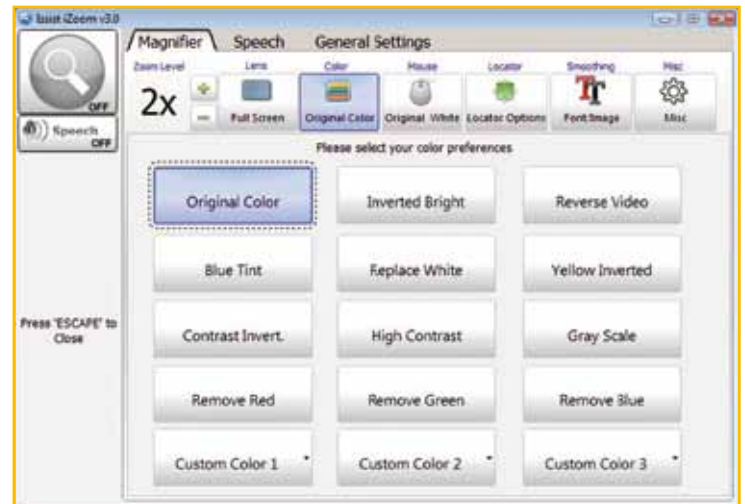
several display options