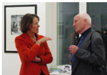
Frau Christina Rau