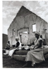
Vita | Biography